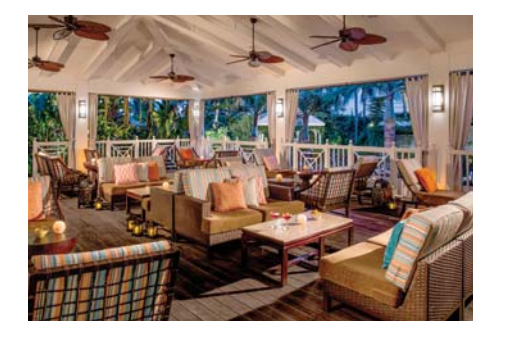
LOUNGE TERRACE Our tropical Lounge Terrace offers space for up to 60 guests for cocktail receptions, pre-event drinks or intimate get-togethers.