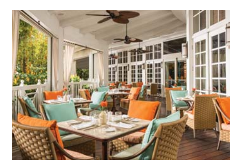
RESTAURANT TERRACE The Restaurant Terrace is also available for small group lunches or dinners for up to 25 guests.

Much loved breakfast and break-out area for corporate groups as well as a great place for after dinner drinks or small get-togethers. The Trellis area can accommodate up to 50 guests Reception and 30 guests Banquet Style.