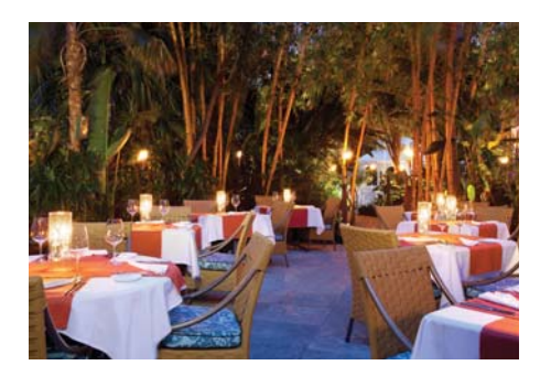
RESTAURANT POOL TERRACE Close to the pool and in the midst of our tropical gardens this terrace is the perfect venue for relaxed lunches or laid-back dinners for up to 60 guests.