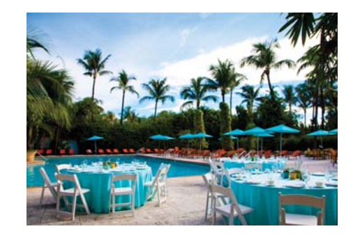
GARDEN POOLSIDE TERRACE Located on the southern part of our pool, this tropical Terrace is the perfect setting for an al-fresco group breakfast of up to 40 people.